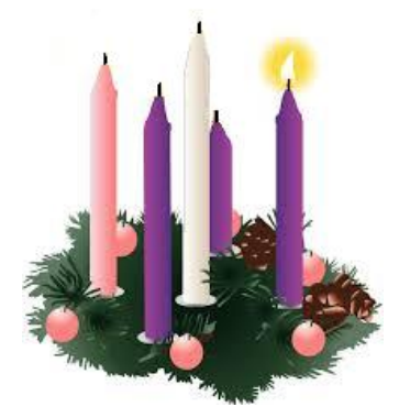
TODAY: St Aidan's Advent Carol Service 6.30pm