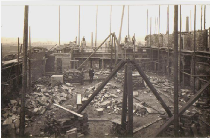
The Church during its construction 100 years ago. More photographs will be on display over the next few months.